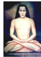
Kriya Babaji Nagaraj