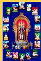
Muruga+18 Siddhas Siddha Tirumular