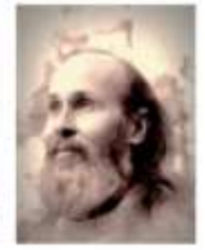
The 18 Siddhas