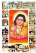
The 18 Siddhas