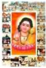
The 18 Siddhas