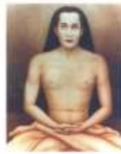
Kriya Babaji Nagaraj