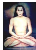
Kriya Babaji Nagaraj