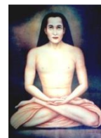
Kriya Babaji Nagaraj