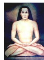
Kriya Babaji Nagaraj