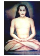
Kriya Babaji Nagaraj