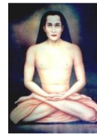
Kriya Babaji Nagaraj