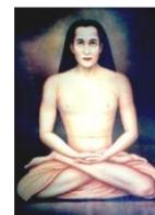
Kriya Babaji Nagaraj