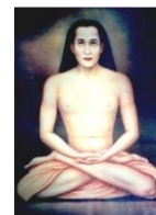
Kriya Babaji Nagaraj