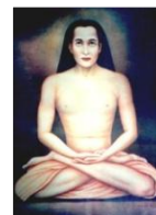
Kriya Babaji Nagaraj