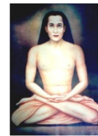
Kriya Babaji Nagaraj