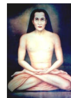
Kriya Babaji Nagaraj